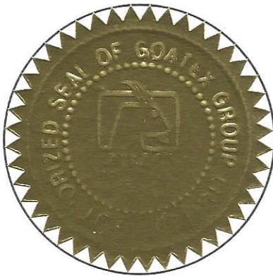
Registered Seal Goatex Group Limited