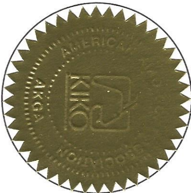
Registered Seal American Kiko Goat Association